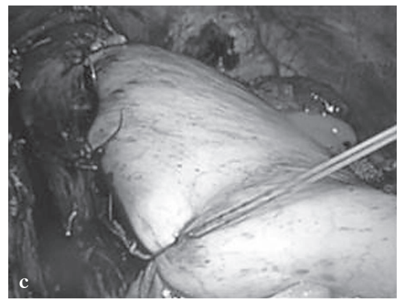
Fig. 3. The abdominal esophagus was exposed through selective proximal vagotomy. Exposure of the abdominal esophagus revealed no periesophagitis (a). After insertion of a 56-Fr esophageal bougie, extramucosal myotomy was performed from approximately 7 cm proximal to and 2 cm distal to the esophagogastric junction (b). After efficient extramucosal myotomy, Dor fundoplication was performed as an antireflux procedure (c).