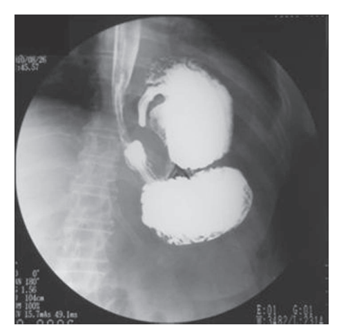
Fig. 2. An upper GI radiographic series demonstrated herniation of most of the stomach into the lower mediastinum.