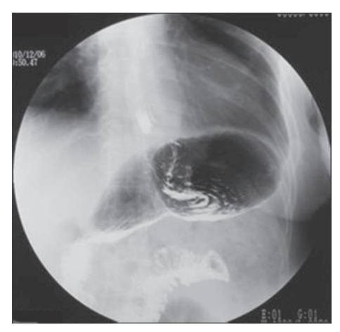
Fig. 5. An upper GI radiographic series performed 3 months after surgery showed the entire stomach to be in the correct position.

tomical abnormalities, such as hiatal hernia. These hernias are categorized by their shape. Type 1 hernias are sliding hernias and are the most common. Type 2 hernias are paraesophageal hernias characterized by paraesophageal herniation of the gastric fundus but with the gastroesophageal junction (GEJ) remaining in its normal abdominal position. Type 3 hernias are mixed hernias in which both the GEJ and the gastric fundus migrate into the posterior mediastinum. Type 4 hernias are rare and are also known as upside-down stomach or intrathoracic stomach¹. The upside-down stomach is defined as gastric volvulus in a huge supradiaphragmatic hernia sac. The present patient was