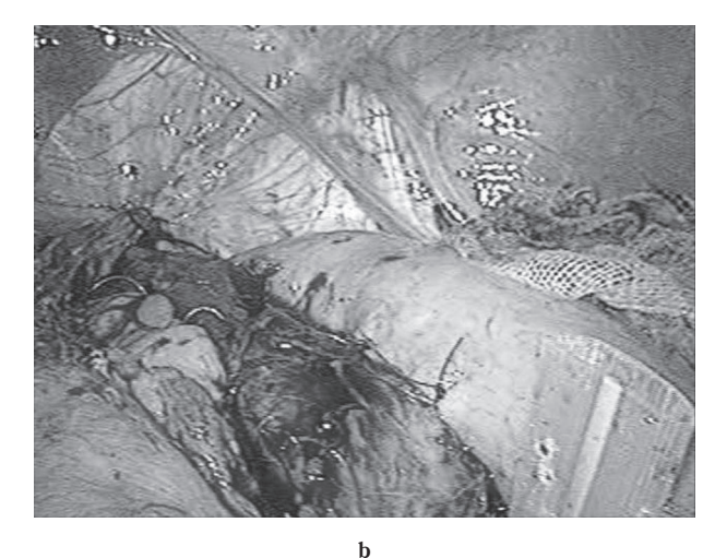
Fig. 4. After the entire stomach had been returned to the abdominal cavity, the overstretched esophageal hiatus was tightened with sutures (a). Then, fundoplication was performed with the Toupet method as an antireflux procedure (b).