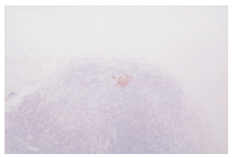
Cytokeratin staining, 3.3\times10 . Micrometastasis was visualized more clearly with cytokeratin staining. Fig. 2. Histopathologic findings.