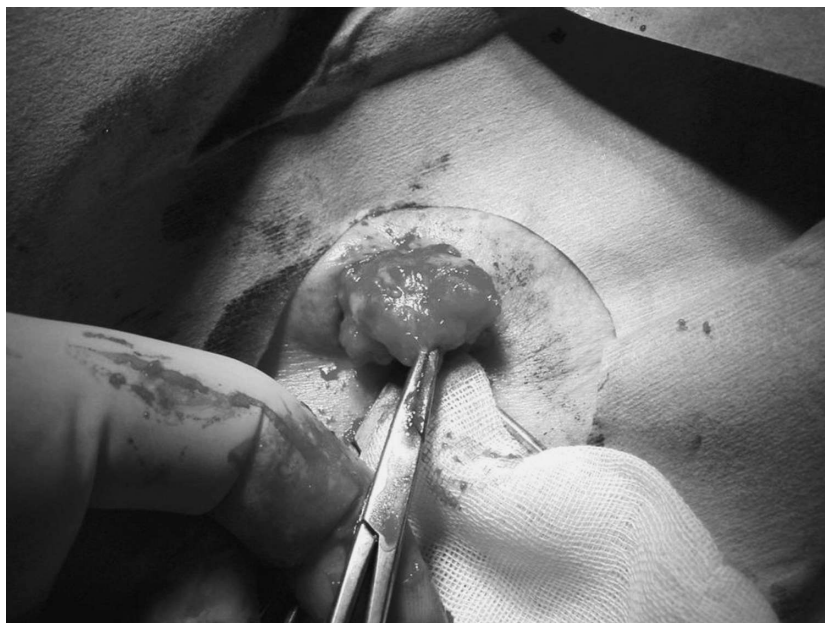
Fig. 2. The tumors were recognized as metastatic lymph nodes by lumpectomy under local anesthesia.